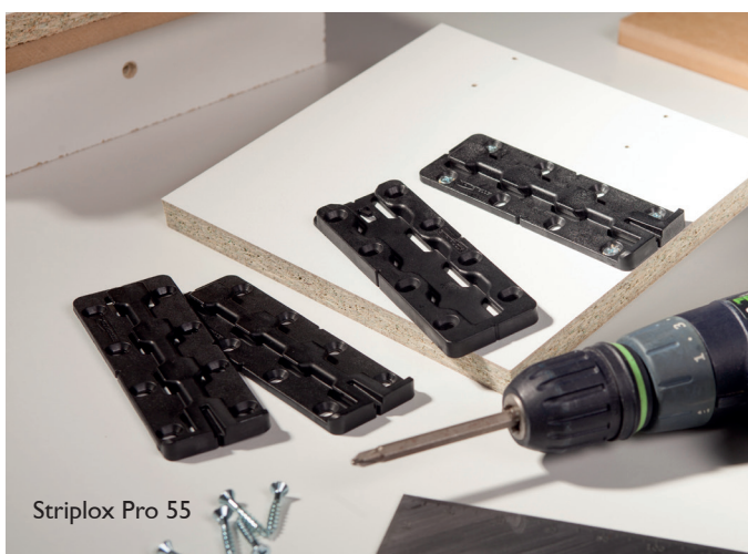
Striplox Pro 55