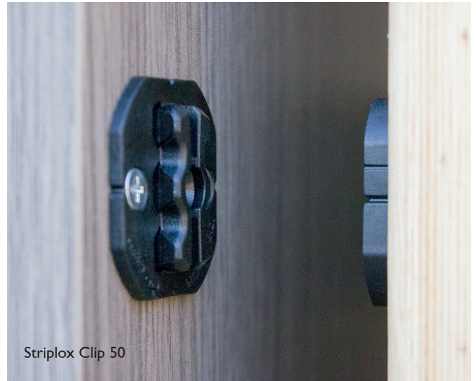
Striplox Clip 50