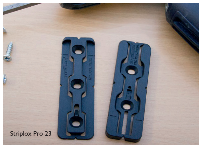
Striplox Pro 23