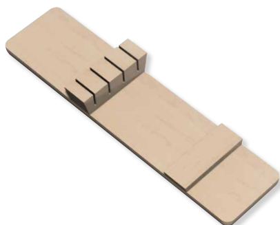
RPC794 KNIFE BLOCK