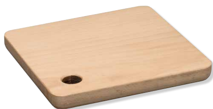
RPC791 CHOPPING BOARD