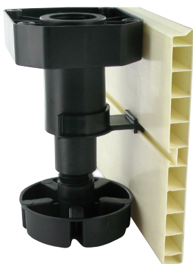
PLINTH CLIP PVC PLINTH

If you use Enko's PVC toe kick these clips have a slightly different shape which allows them to be slid into the channel on the back of the PVC board, making for easy attachment to the legs.