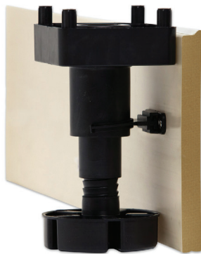
PLINTH CLIP SOLID BOARD

If you use traditional toe kick (melamine, MDF etc.) the Plinth Support Clips mentioned on the previous page allow easy attachments (and removal later if required) of the toe kick to the legs.